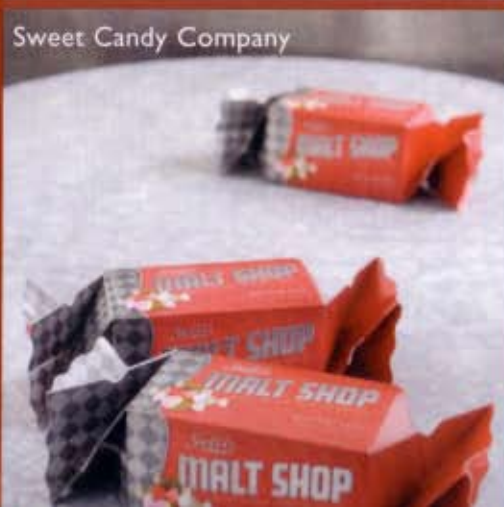
Sweet Candy Company