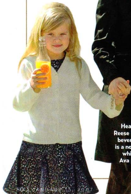
Healthy family! Reese Witherspoon's beverage of choice is a nonfat soy latte, while daughter Ava prefers juice.

Discover star secrets to looking slim. Visit Usmagazine.com